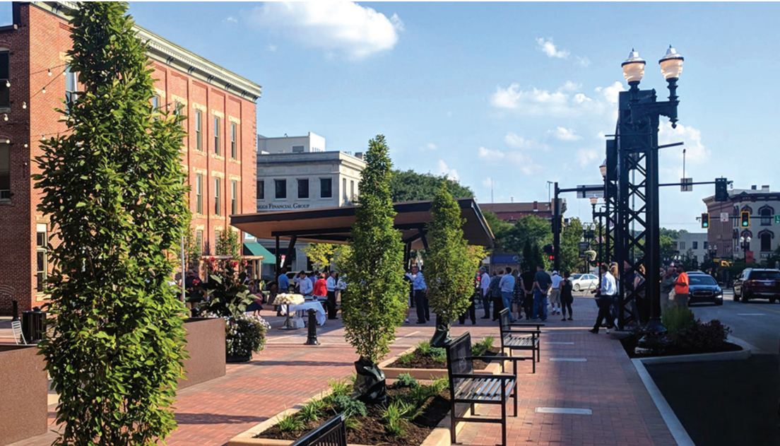
RAISED LANDSCAPE BEDS AND PAVED AMENITY STRIP W/BUMP-OUTS