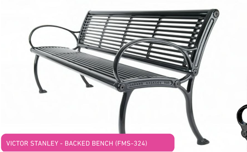
VICTOR STANLEY - BACKED BENCH (FMS-324)