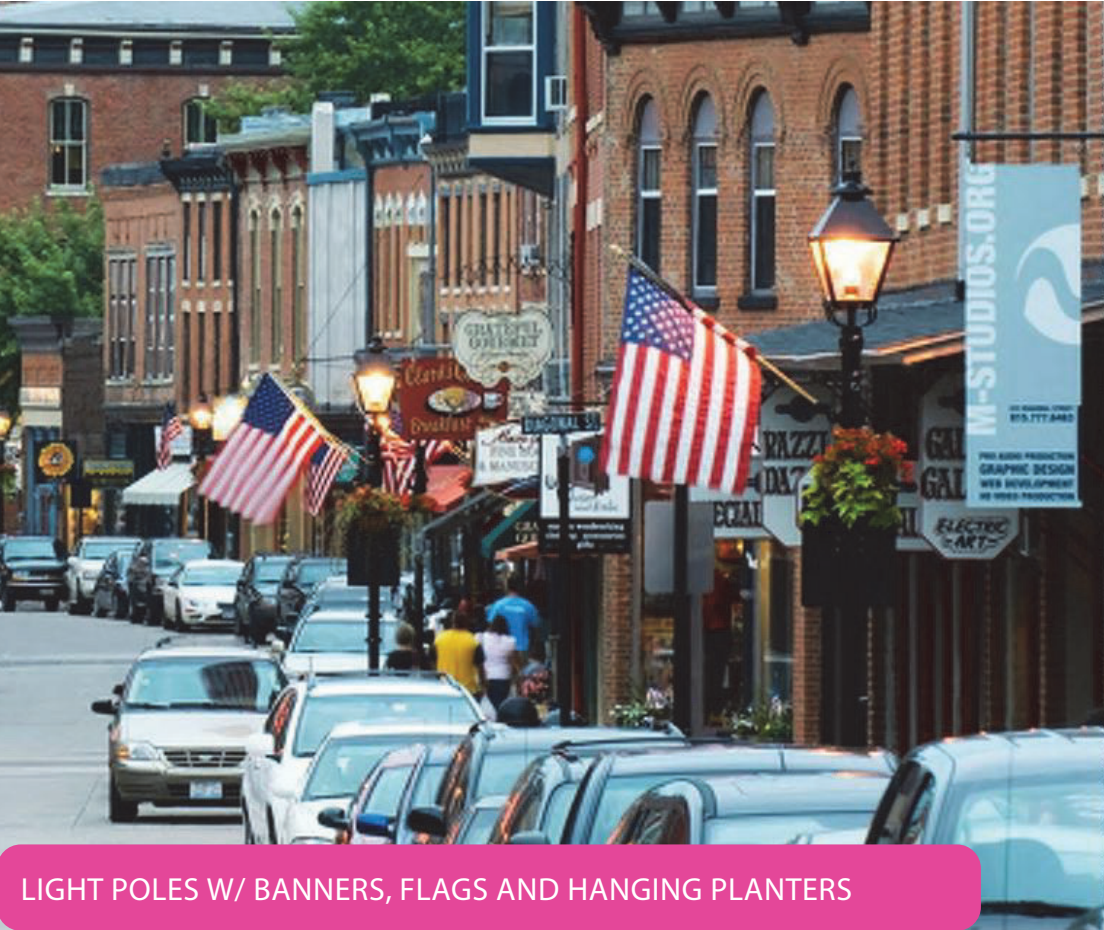
LIGHT POLES W/ BANNERS, FLAGS AND HANGING PLANTERS