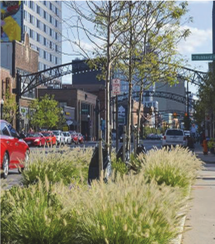
STREET TREES AND PLANTERS