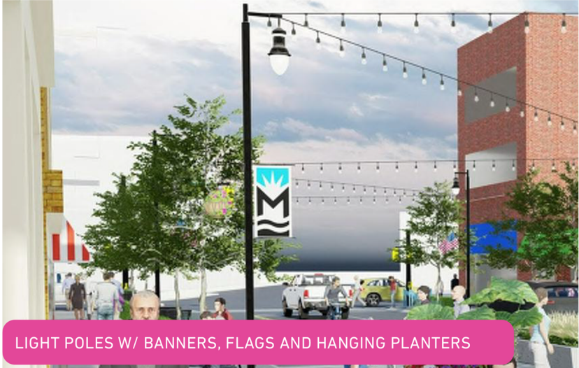
LIGHT POLES W/ BANNERS, FLAGS AND HANGING PLANTERS