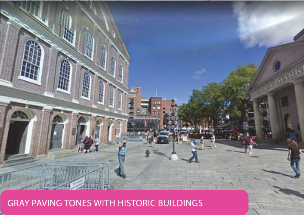
GRAY PAVING TONES WITH HISTORIC BUILDINGS