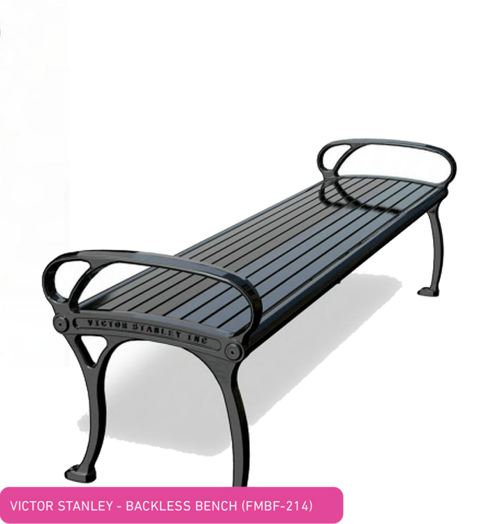
VICTOR STANLEY - BACKLESS BENCH (FMBF-214)