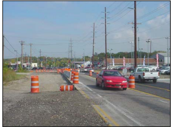
Cincinnati-Dayton Road widening project

Widening of Union Road (within the current Middletown limits) from just south of S.R. 122 northwardly, has been designed and ready for bids and should be improved in late 2005. The remaining sections to the south and north are again on the City’s long-range plan but no funding is available at present. Completing the Union Road “parallel roadway” will need to be coordinated with the Cities of Franklin and Monroe as well as Warren County, Franklin Township and Turtlecreek Township.